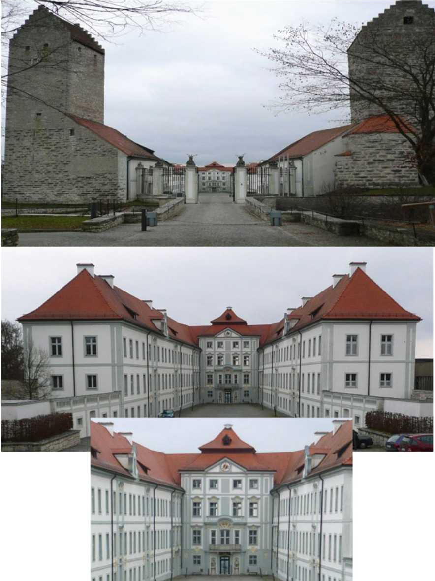
Fig. 1 Hirschberg Castle of the bishopric of Eichstätt above the city of Beilngries in the valley of the Altmühl