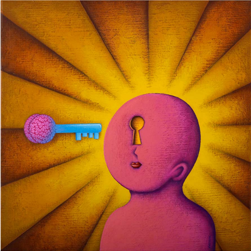
This image was created by DADARA