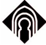
UNIVERSIDAD DE CASTILLA LA MANCHA