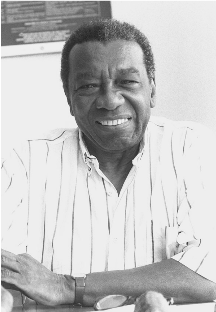
Milton Santos, 1994.