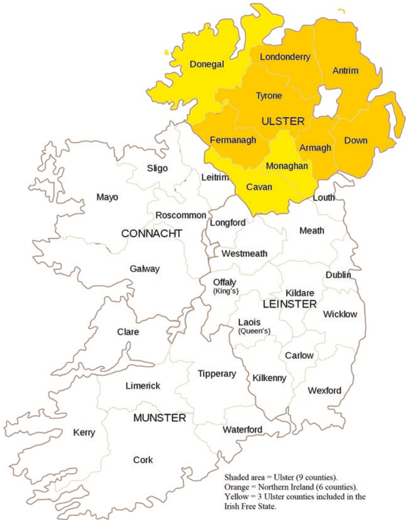
Map 1 Ireland, Ulster, and Northern Ireland, by county