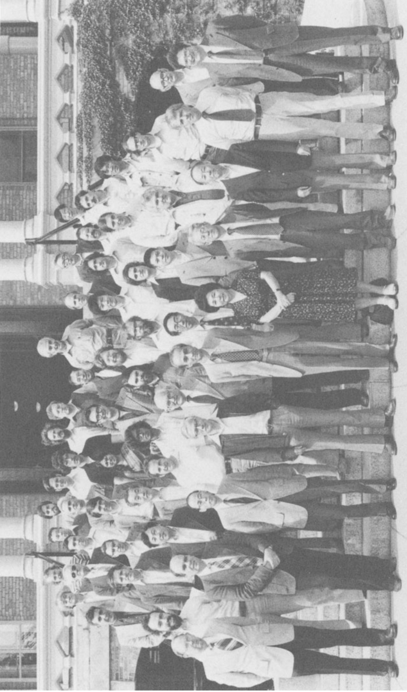
Matsushima Conference, May 14-15, 1980