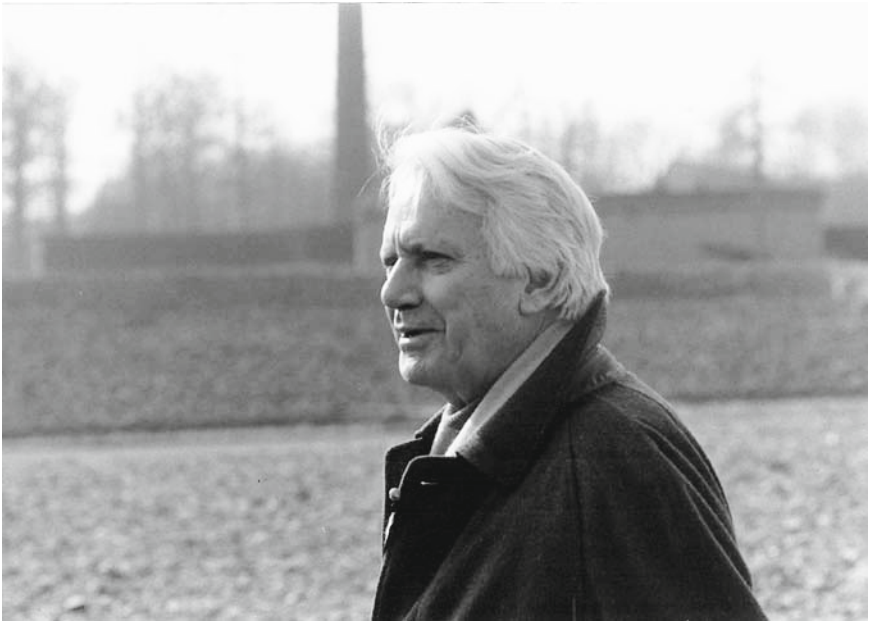
Jorge Semprún, during his first visit, after liberation, to Buchenwald in 1992.