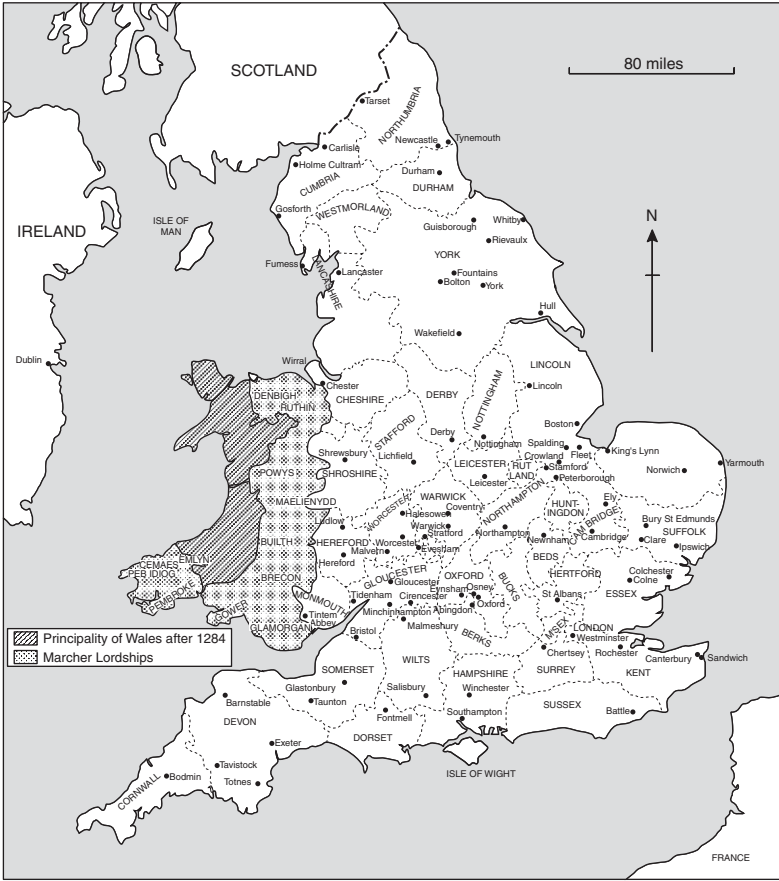
Wales and England after 1284