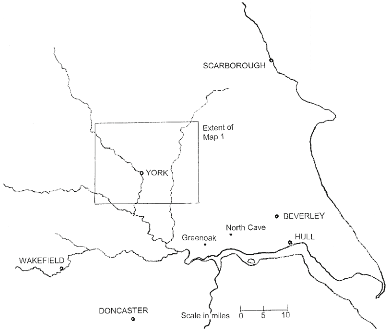
Map 2 South and East Yorkshire