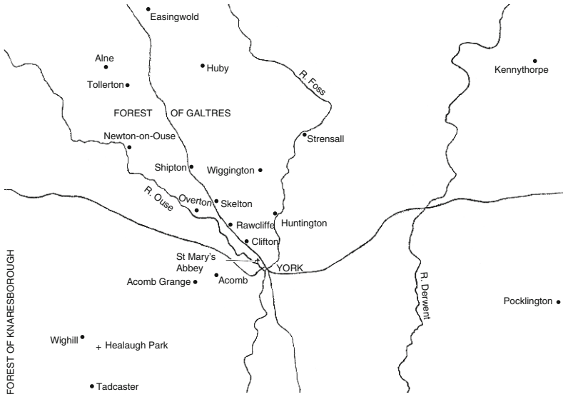
Map 1 York and its environs