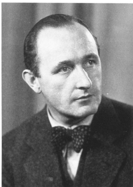
Carl Ludwig Siegel