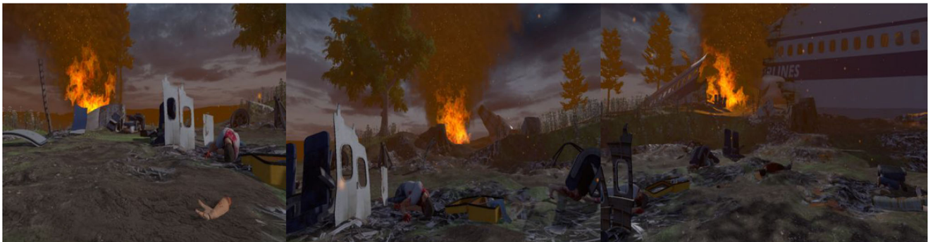
Fig. 2. Pictorial Examples from the Virtual Reality Plane Crash Scene