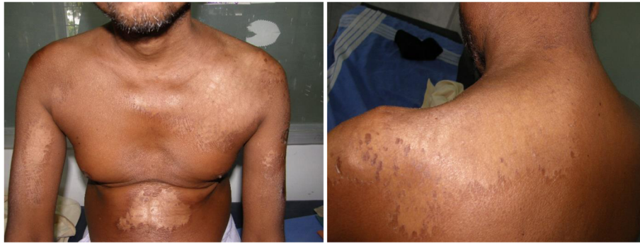
Fig. 3 Improvement of the skin lesions after the commencement of the treatment

typical lesion occurs around the nape of the neck termed as Casal's necklace and the erythema occurs recurrently over the sun-exposed area. The gastrointestinal symptoms include diarrhea, nausea, vomiting, decreased appetite, gastritis, and achlorhydria [5]. The neuropsychiatric symptoms of pellagra are not well defined and frequently confounded with other central nervous system disorder. The symptoms like headache, irritability, poor concentration, apathy, depressed mood, psychomotor unrest, and ataxia will occur, and these symptoms may progress to stupor and coma [11]. Serum niacin levels are used to estimate the levels of N-methyl nicotinamide, which is used in confirming the disease [12]. Many times, the diagnosis is made on the basis of clinical examination and confirmed by rapid response to oral nicotinamide [7]. The histopathology of the skin usually will show nonspecific features like hyperkeratosis, parakeratosis, pallor of the upper epidermis, capillary dilatation, dermal edema, and perivascular lymph histiocytic infiltrate [7].