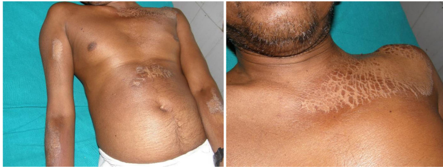
Fig. 2 Multiple well define macules predominantly involving the photo distributed areas like arm, forearm, left shoulder and epigastric region with dry overlying surface

adenine nucleotide (NAD) and NADPH. These molecules undergo hydrolysis in the intestinal lumen to form nicotinamide, which can be converted to nicotinic acid by intestinal bacteria or absorbed directly into the bloodstream. Nicotinamide and nicotinic acid are then reincorporated as a component of coenzymes NAD and NADP, which in turn intervene in essential oxidation-reduction reactions. The ubiquitous presence of these coenzymes explains the multiorgan afflictions associated with pellagra. Tissues with high energy requirements such as the brain or high turnover rates such as gut or skin are primarily affected [5, 8]. The exquisite photosensitivity seen in pellagra may result from a deficiency of urocanic acid and/or cutaneous accumulation of kynurenic acid that may induce a phototoxic reaction [5, 9]. The recommended daily allowance of niacin is 15–20 mg/day [10]. The pellagra is divided into primary pellagra and secondary pellagra. The primary subtype mainly occurs due to dietary deficiency of niacin or tryptophan predominantly seen in people whose staple diet