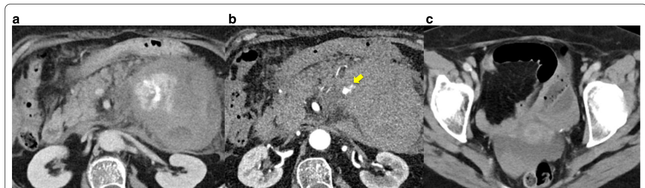
Fig. 1 Contrast enhanced computed tomography. a The retroperitoneal hematoma and extravasation of contrast spread to the ventral side of the left kidney. b Aneurysm (yellow arrow) from a branch of the superior mesenteric artery. c Ascites in the pelvis

We diagnosed her with a ruptured artery aneurysm of the TPA originating from the SMA. We conferred with our IVR team on treatment strategy for the ruptured aneurysm. In addition, we finally selected operation since the branch of the SMA to the aneurysm was too thin and complex to conduct IVR. In addition, the patient went into shock in the emergency room. For these reasons, we immediately performed emergency surgery. When we opened the abdomen, we found hematoma in the omental bursa. We opened the omental bursa and removed the transverse mesocolon from the lower edge of the pancreas. There was massive hematoma behind the pancreas. After removing the hematoma, we found that a branch of the SMA was bleeding. This branch was the TPA and