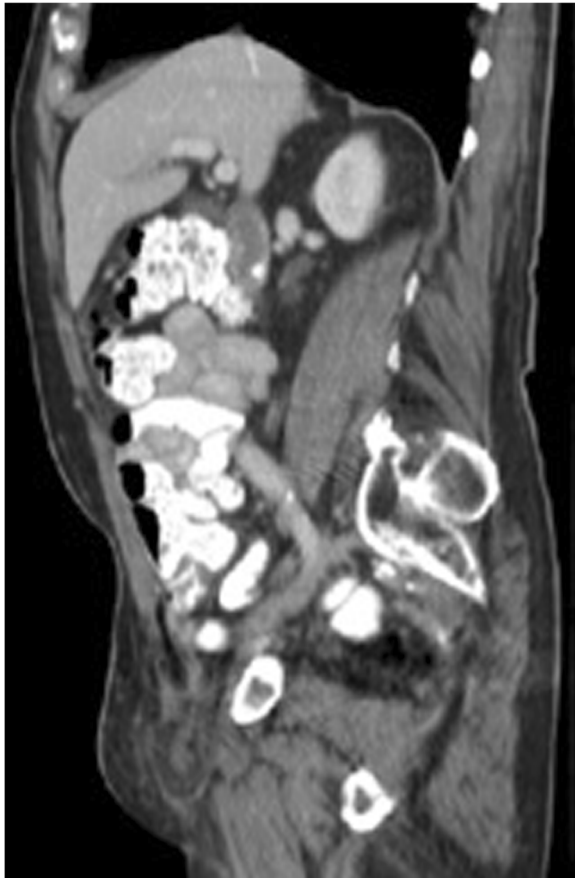
Fig. 1 Computed tomography sagittal view of the appendix and omentum within the hernia

the sac. Preoperative laboratory testing revealed a white blood cell count of 4.7 \times 10^9/L . The patient elected to proceed with surgical intervention for hernia repair.