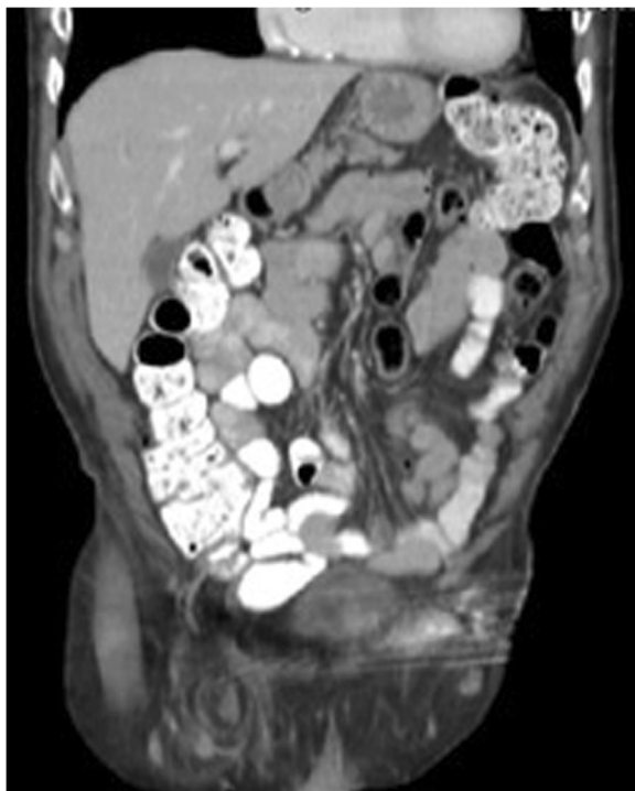
Fig. 3 Computed tomography coronal view of described Amyand hernia

In 2007, Losanoff and Basson proposed an Amyand hernia classification system with recommendations for surgical management that may prove very useful for intraoperative decision making for such a diagnosis [4] (Table 1). Certainly, these must be guided with the hallmark principles of general surgery—critical thinking and common sense—and adapted on a case by case basis. By