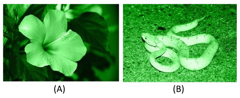
Fig. 1 Examples of the stimuli used in the experiment. a image of flower in green and b image of snake in green. Both photos were taken by one of the authors of the current report

No experiment began without assuring that the participants had understood the instructions given. To assure this, the parents of the children with ASD were asked to