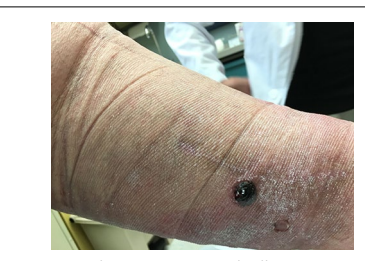
Fig. 3 Right posterior lower extremity bulla

Enoxaparin was the most frequent culprit anticoagulant (66%), followed by fondaparinux (12%). On average, lesions appeared after 7 days of treatment (7.0 \pm 6.4), and resolved after 2 weeks of discontinuation of anticoagulation (13.0 \pm 7.4). Most cases of bullous lesions (67.9%) were reported on the extremities only, followed by torso and extremities (26.4% of cases). Lesions on the head and neck were rare (5.5%). Management consisted of discontinuation of culprit anticoagulant (57% of cases), continuation (23.1%), or treatment change or dose reduction (14.3%). There was no difference in time to resolution between patients who continued the culprit anticoagulant or changed to a different anticoagulant, and those who discontinued anticoagulation altogether (13.9 days vs. 12.1, p=0.49).