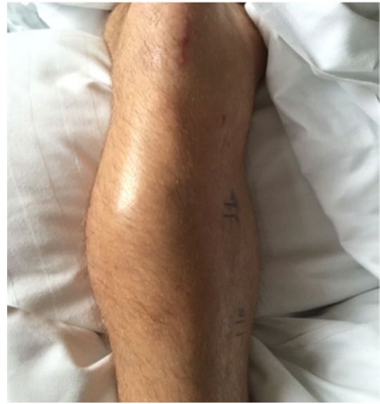
Fig. 2 Recurrent swelling of the right lower leg 10 weeks after initial trauma

Four weeks later, the patient was readmitted for reoccurring swelling of the proximal lower leg and additional pain and numbness of his dorso-medial foot (Fig. 2). Due to the intermittent nature of his complaints combined with neurologic symptoms, a CT angiography was performed which revealed a pseudoaneurysm of the anterior