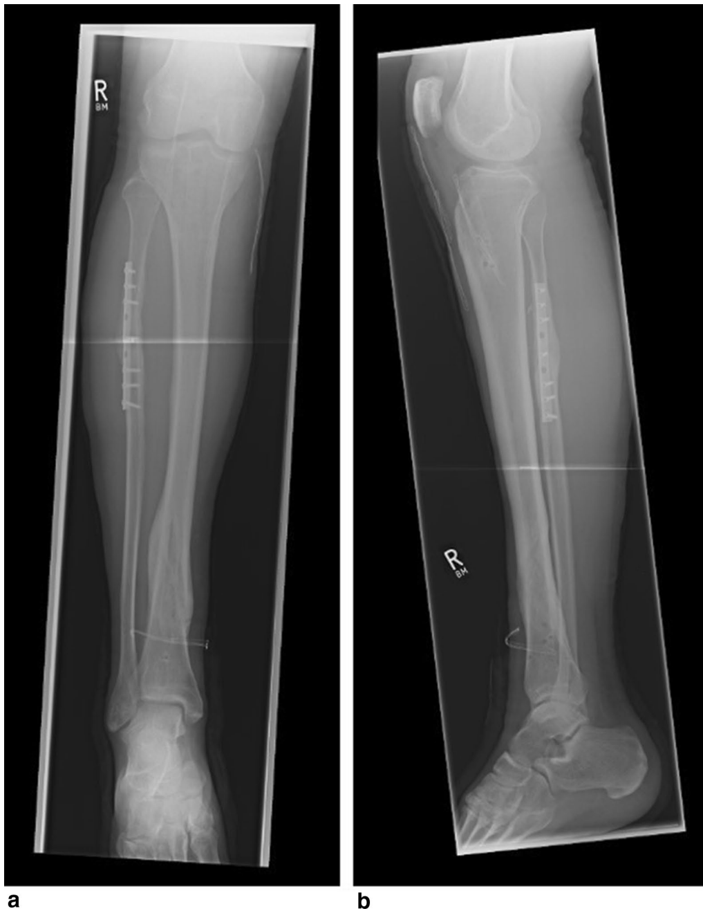
Fig. 6 Antero-posterior ( a ) and medio-lateral ( b ) radiographs 1 year after surgery, showing complete recovery of the tibial fracture and the remaining plate for fibula fracture reduction