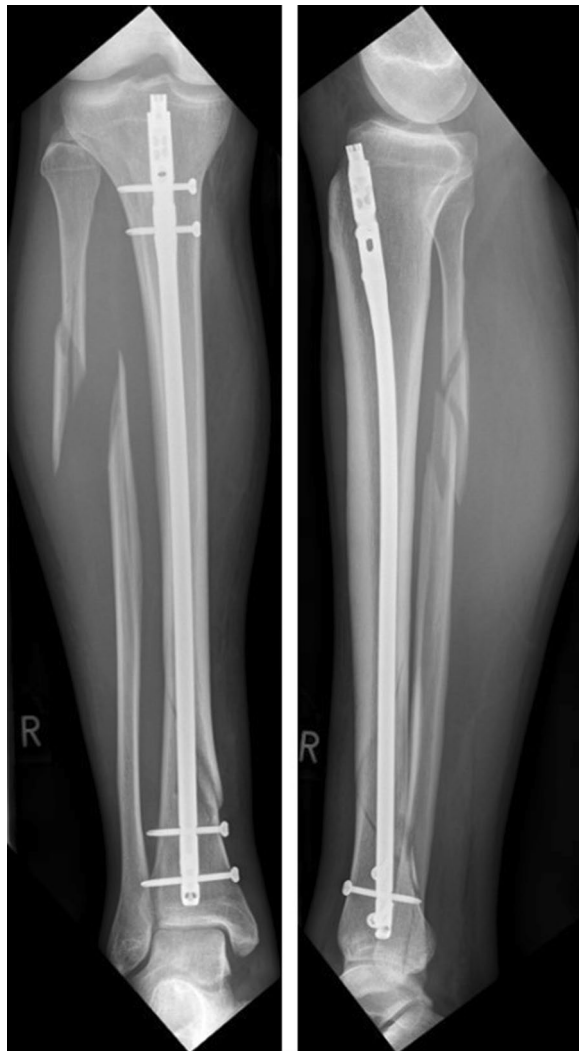
Fig. 1 Antero-posterior (a) and medio-lateral (b) radiographs of the right lower leg showing fracture reduction

its close proximity to the distal tibial–fibular joint. The patient was discharged 3 days later after his symptoms had improved.