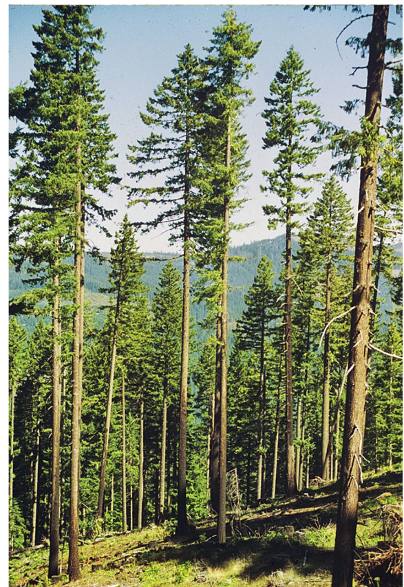
Fig. 2 The first retention harvest conducted by the senior author on the Willamette National Forest, Oregon; the prescription was for 15% retention of live basal area in sound dominant and co-dominant mature Douglas-fir distributed uniformly over the harvested site. This selection of retained trees was done with the goal of both high levels of survival and availability of high-quality trees for harvest during the next harvest cycle

On May 18, 1980, Mount St. Helens experienced a catastrophic eruption that created a large “devastated” region of ~ 75,000 ha, much of it located on the Gifford Pinchot National Forest in Washington. Many scientists