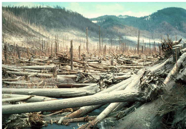
Fig. 3 The eruption of Mount St. Helens on May 18, 1980, left behind significant legacies of living and dead organic matter (including snags and logs), which were important elements in the development of the post-eruption ecosystems; this environment provided the stimulus for recognition of the concept of biological legacies of disturbances and a natural model for variable retention harvesting. Note that these legacies have both biological and physical influences on the post-disturbance ecosystem