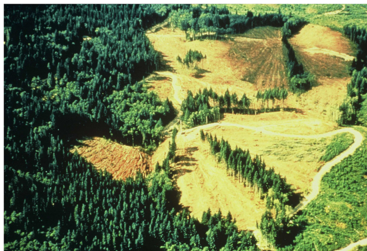
Fig. 4 After experimenting with different approaches to retention, the Plum Creek Timber Company found aggregated retention, as seen here on the Cougar Ramp Unit, was an effective approach to integrating environmental and timber management objectives. This cutting opened the senior author's mind to the potential of aggregated retention, which today is generally viewed as the most important approach for conserving a broad array of biota

A wide variety of responses to the treatments have been studied following establishment including growth and mortality of the leave trees, tree regeneration, understory composition, mycorrhizal fungi, small mammals, breeding birds, canopy arthropods, bats, and amphibians. Measurements of some variables (primarily trees and other vegetation) are continuing. One key