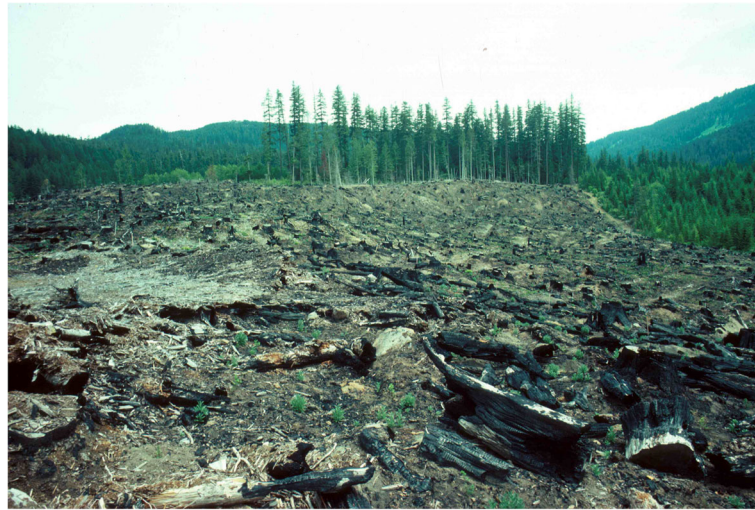
Fig. 1 Typical staggered-setting clear-cut in old-growth Douglas-fir forest on the Willamette National Forest (Oregon) in the late 1970s; note the high level of utilization and lack of significant slash after a broadcast burn of the site, which were considered to be evidence of good management

Hence, casual experimentation began with the purposeful retention of green trees on federal forestlands for wildlife as well as to achieve other ecological objectives. Some early trials were conducted on the H. J. Andrews and Wind River Experimental Forests (Fig. 2). These demonstrations involved retention of dominant and co-dominant Douglas-fir trees representing about 15% of the pre-harvest live basal area. Leave trees were distributed uniformly over the harvest areas approximating a shelterwood overstory; however, the retained trees were to remain through the entire next rotation. Survival of the overstory trees and regeneration and growth of commercially important tree species was good over the next 35 years.