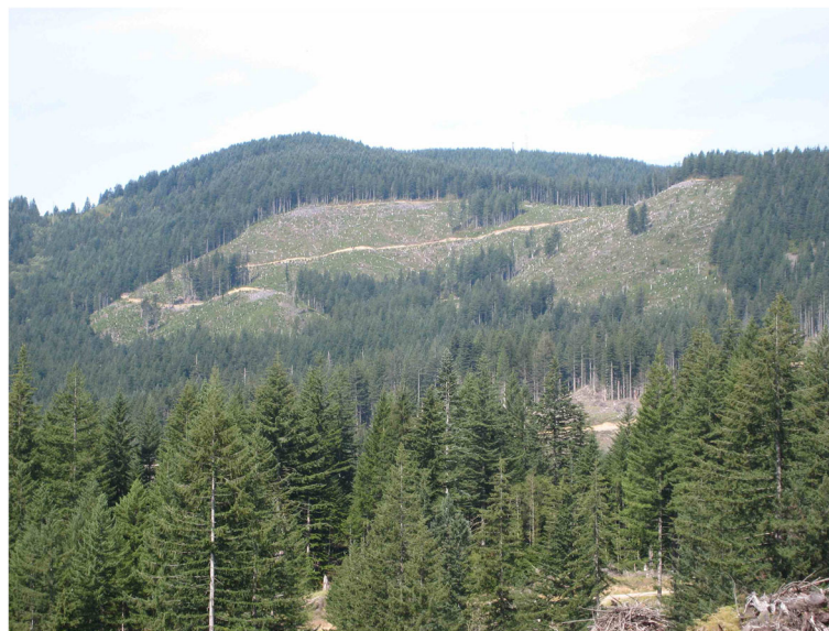
Fig. 6 Example of variable retention harvest as practiced across > 500,000 ha of lands managed by the Washington State Department of Natural Resources. Variable retention has been the DNR's primary approach to regeneration harvests since the late 1990s, with an overall objective of maintaining and promoting large structurally unique trees, snags, and down wood over time. The minimum retention of 20 trees per hectare (mix of dispersed and aggregated pattern depending on individual unit) occurs in addition to that in riparian buffers, unstable slopes, gene pool reserves, old-growth deferrals, and other conservation-driven allocations

The United States Forest Service (USFS), which manages the national forests, currently is obliged to use variable retention harvesting within the area of the Northwest Forest Plan. At this point in time, almost all timber