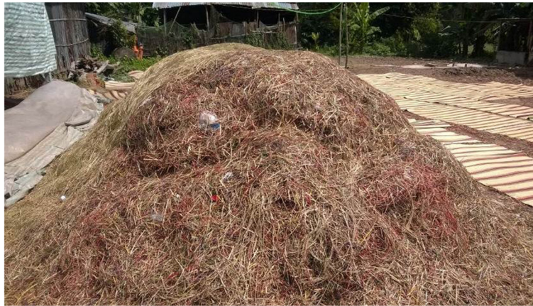
Fig. 4 Solid waste from sedge mats production

oxidation method cannot help textile wastewater to meet discharge standards; however, the integration of Fenton's oxidation process with a downstream SBR provides much better removal of organic matter (88–98 % for COD, 83–95 % for BOD 5 , and 91–98 % for DOC—values depending on the particular textile effluent being used) and color (>99 %) [26]. Punzi and colleagues have suggested that the use of ozonation as short post-treatment after a biological process can be beneficial for the degradation of recalcitrant compounds and removal of toxicity of the textile wastewater [27].