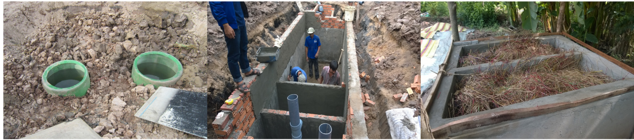
Fig. 6 The system components is being under construction

for the households and to maintain the sustainability of the rural craft production.