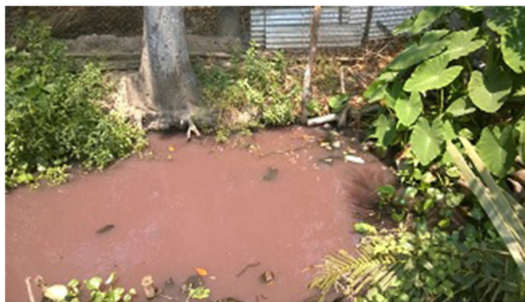
Fig. 3 A natural pond—receiving source of wastewater—is heavy polluted by the dyeing process wastewater

Important pollutants in textile effluent are mainly dyes that are the most difficult constituents of the textile wastewater to be treated. Azo-dyes are the class of the most widely used dyes industrially having a world market share of 60–70 %. The residues of dye presented in the effluent may consist of 50 % of the influent flow [24], and these cause the textile wastewater high color, and high pollutants concentration. A research on using sequencing batch reactor technology (SBR) to decolorize the dyeing wastewater was done in Erode, Tamil Nadu, India, and results show that the color and COD removal efficiencies were 86.6 and 96 %, respectively [25]. The separate use of biological treatment methods as SBR and