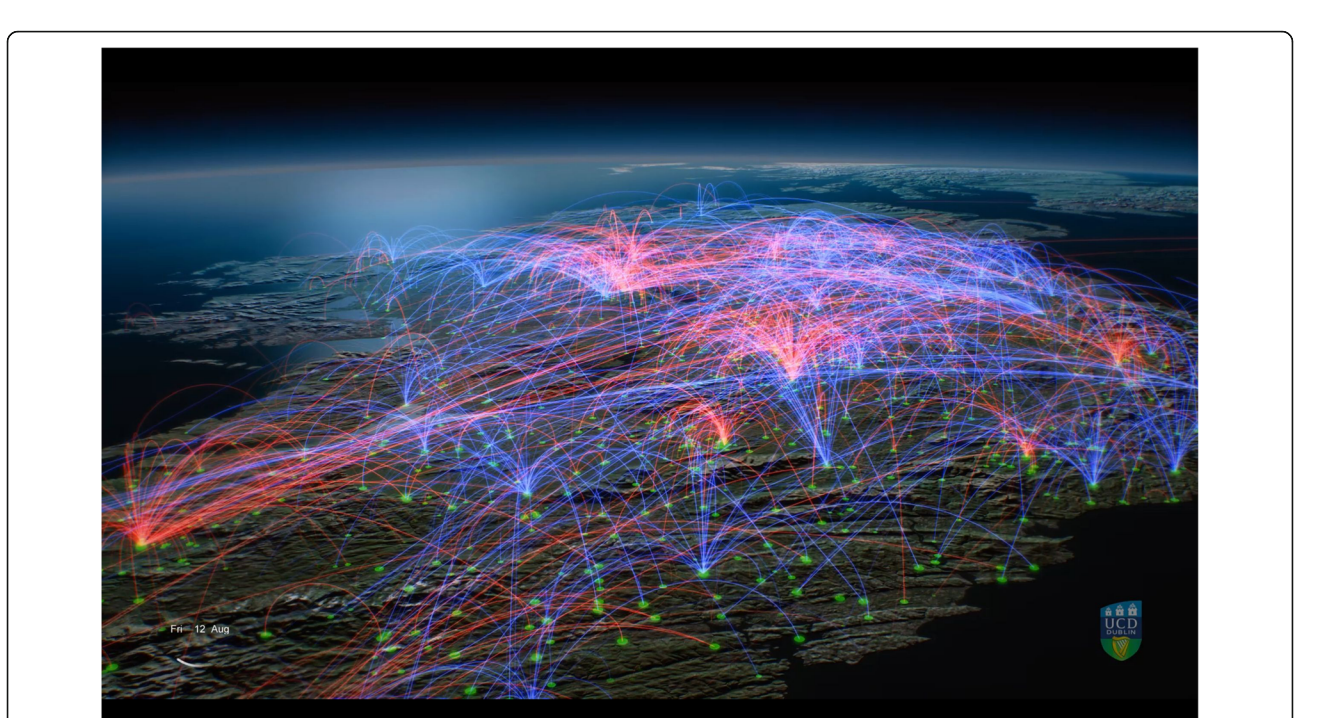
Fig. 1 Screenshot of an animation showing cattle movement events (for example, the movement of a trailer, which may contain a number of cattle) in Ireland. Red lines represent 'High Risk' moves, those where animals are traded between herds in Ireland (including trade via a market), as well as a small number of imports; blue lines represent 'Low Risk' - moves to slaughter or an export point. In this study, a movement from farm to market and subsequent onward movement to farm was counted as two movement events