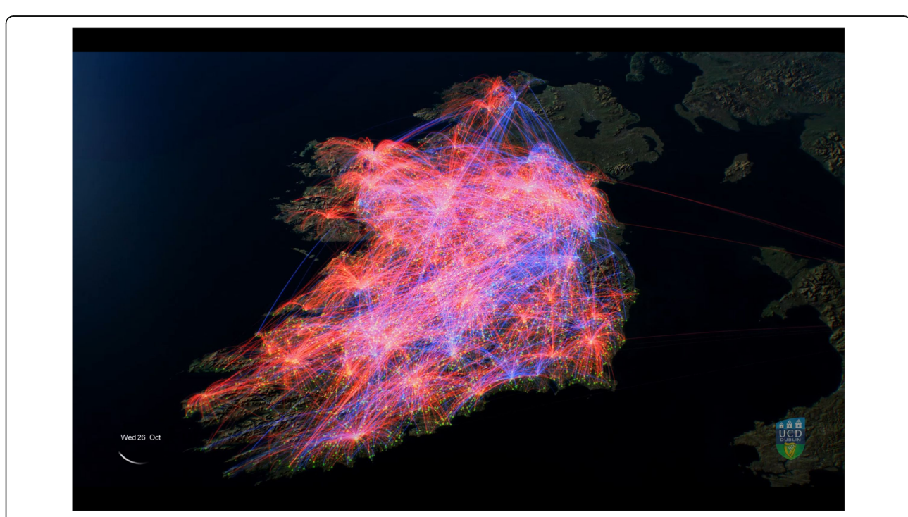
Fig. 2 Screenshot of an animation showing cattle movement events (for example, the movement of a trailer, which may contain a number of cattle) in Ireland. Red lines represent 'High Risk' moves, those where animals are traded between herds in Ireland (including trade via a market), as well as a small number of imports; blue lines represent 'Low Risk' - moves to slaughter or an export point. In this study, a movement from farm to market and subsequent onward movement to farm was counted as two movement events

Fig. 1 Screenshot of an animation showing cattle movement events (for example, the movement of a trailer, which may contain a number of cattle) in Ireland. Red lines represent 'High Risk' moves, those where animals are traded between herds in Ireland (including trade via a market), as well as a small number of imports; blue lines represent 'Low Risk' - moves to slaughter or an export point. In this study, a movement from farm to market and subsequent onward movement to farm was counted as two movement events