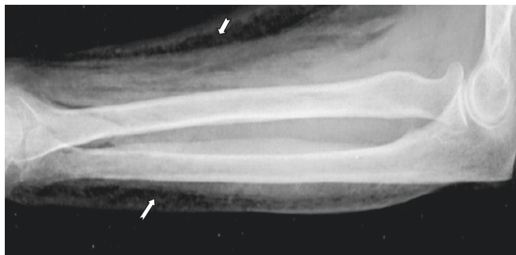
Fig. 2 X-ray profile of her right arm showing subcutaneous emphysema (arrows)

A psychiatric consultation was requested to confirm the diagnosis of a factitious disorder and treatment. Maltreatment history and emotional abuse during childhood were reported. Her psychiatric report stipulated that the act of self-injection of the needle and her need to draw