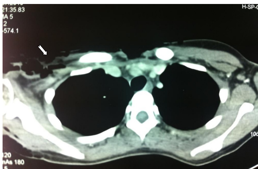
Fig. 3 Thoracic computed tomography image showing a diffuse subcutaneous emphysema (arrow showing emphysema)

attention to this was largely involuntary, whereas her trickery and simulation of a disease were involuntary and with no external gain or incentive therefore confirming Munchausen syndrome.