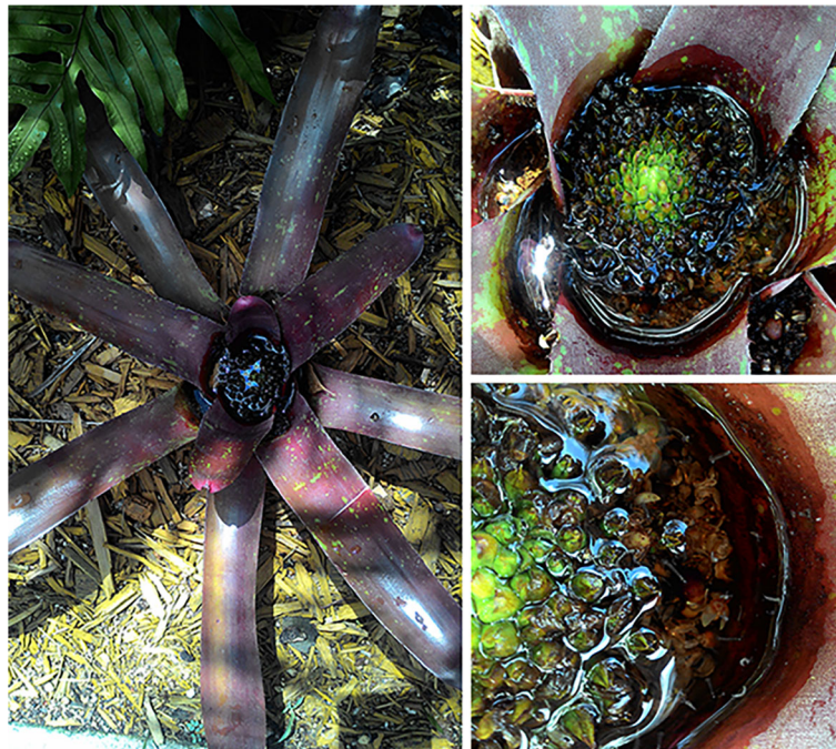
Fig. 2 Ornamental bromeliads breeding vector mosquitoes