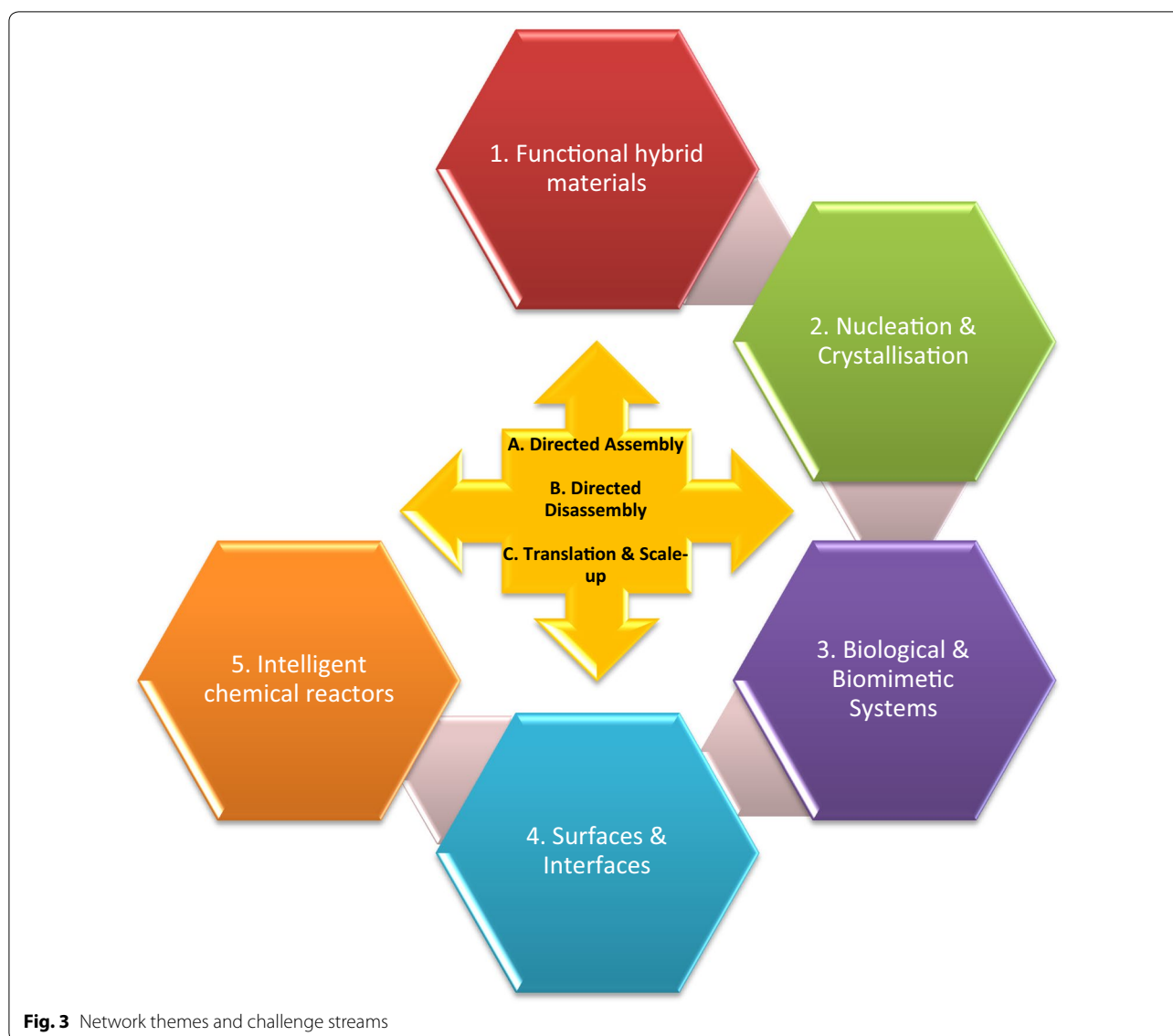
Fig. 3 Network themes and challenge streams

ECRs are a key focus and as such, the network has just over 25% ECR membership. Specific meetings are held to promote ECRs, along with a network mentoring system. We have now seen many of the ECRs develop and achieve more senior positions and some have now joined the Network Management Team.