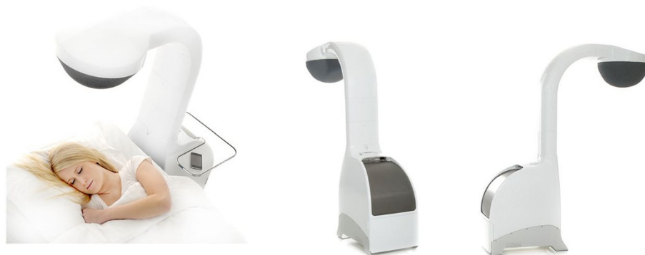
Fig. 2 The temperature-controlled Laminar Airflow (TLA) device (Airsonett.)

The active TLA device (Airsonett™) significantly reduces nocturnal allergen exposure by filtering ambient air through a high efficiency particulate air filter, slightly cooling ( 0.5\text{--}0.8^\circ\text{C} ) and 'showering' it over the participant during sleep (Fig. 2). The reduced temperature allows the filtered air to descend in a laminar stream, displacing allergen-rich air from the breathing zone reducing allergen exposure without creating draft or dehydration. The device is installed next to the participant's bed by a qualified engineer from the company. The device is pre-programmed to turn on and off at times specified by the trial participant but can be turned on and off by manual override if the participant wishes to use the device for an extended period or turn the device