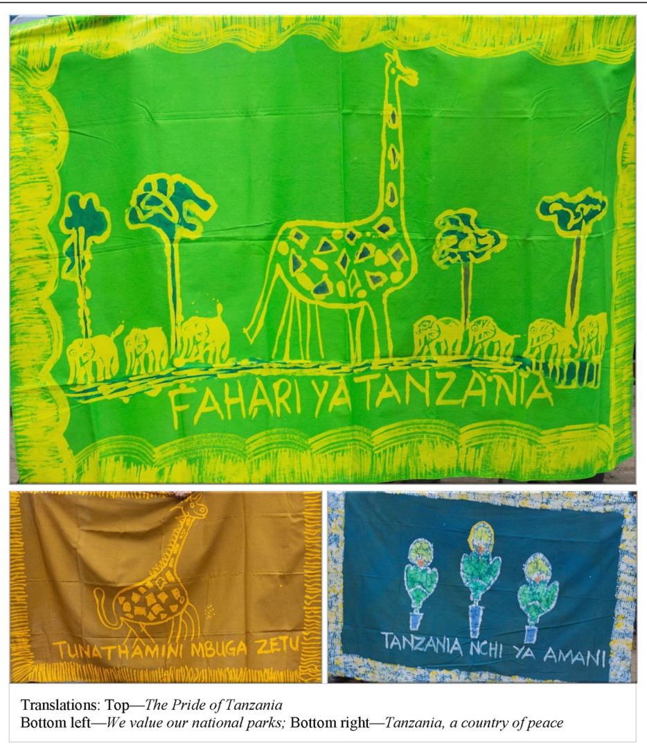
Fig. 2 Adolescents designed Kangas printed on fabric

and community members, through supported engagement and learning with adolescents. Several fathers involved in Discover, who are often overlooked in gender transformative programming, described shifts in their own gender norms, beliefs and behaviors. Fathers expressed recognition that their daughters needed time to study, rather than completing household chores. Fathers reported encouraging their daughter's goals and enthusiasm for learning. One father described his motivation to change his own behavior and share household chores equally with his wife after using the parent-youth workbook and completing activities and reflective discussions with his child. These types of experiences are critically valuable for girls who often face harmful gender norms that limit their pursuit of heartfelt goals. Receiving reinforcement and recognition from parents/ caregivers and at the same time, witnessing their parents/caregivers modeling those changes in their own