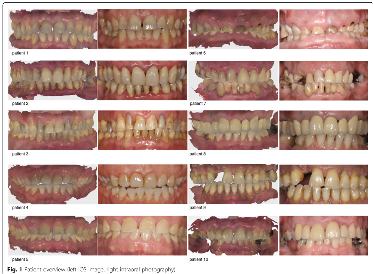
Fig. 1 Patient overview (left IOS image, right intraoral photography)

The continuous development of hard- and software has made it possible to electronically capture and transmit clinical pictures of patients. The accuracy of teledentistry, however, depends on the selected field of view. Two-dimensional intraoral images have their shortcomings, because they represent a limited two-dimensional