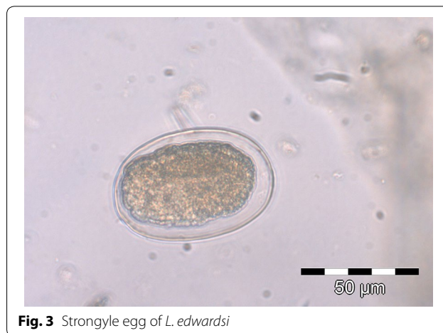
Fig. 3 Strongyle egg of L. edwardsi

exponential function, the probability of shedding parasite eggs was three times higher for L. edwardsi than for A. occidentalis (CI 1.3–8.6, Table 3). In addition, season clearly had an influence on strongyle infections in A. occidentalis , showing 0.0% prevalence in the dry season, but 37.5% prevalence in the rainy season (Table 2). However, this was not the case for L. edwardsi , as likelihood of infection was not significantly affected by season for neither parasite morphotype (Table 3). The number of tree holes used as sleeping sites by L. edwardsi did not significantly affect their likelihood of infection with either parasite. Finally, neither host species showed a significant effect of sex on parasite infection; 37.2% of males and 44.2% females of L. edwardsi as well as 75.0% of males and 69.2% females of A. occidentalis were tested positive.