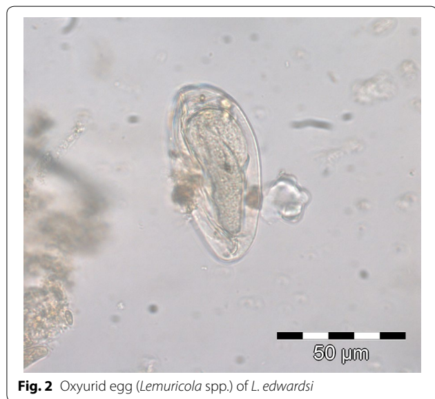
Fig. 2 Oxyurid egg ( Lemuricola spp.) of L. edwardsi

A statistically significant effect of host species on parasite infection status was observed. According to the