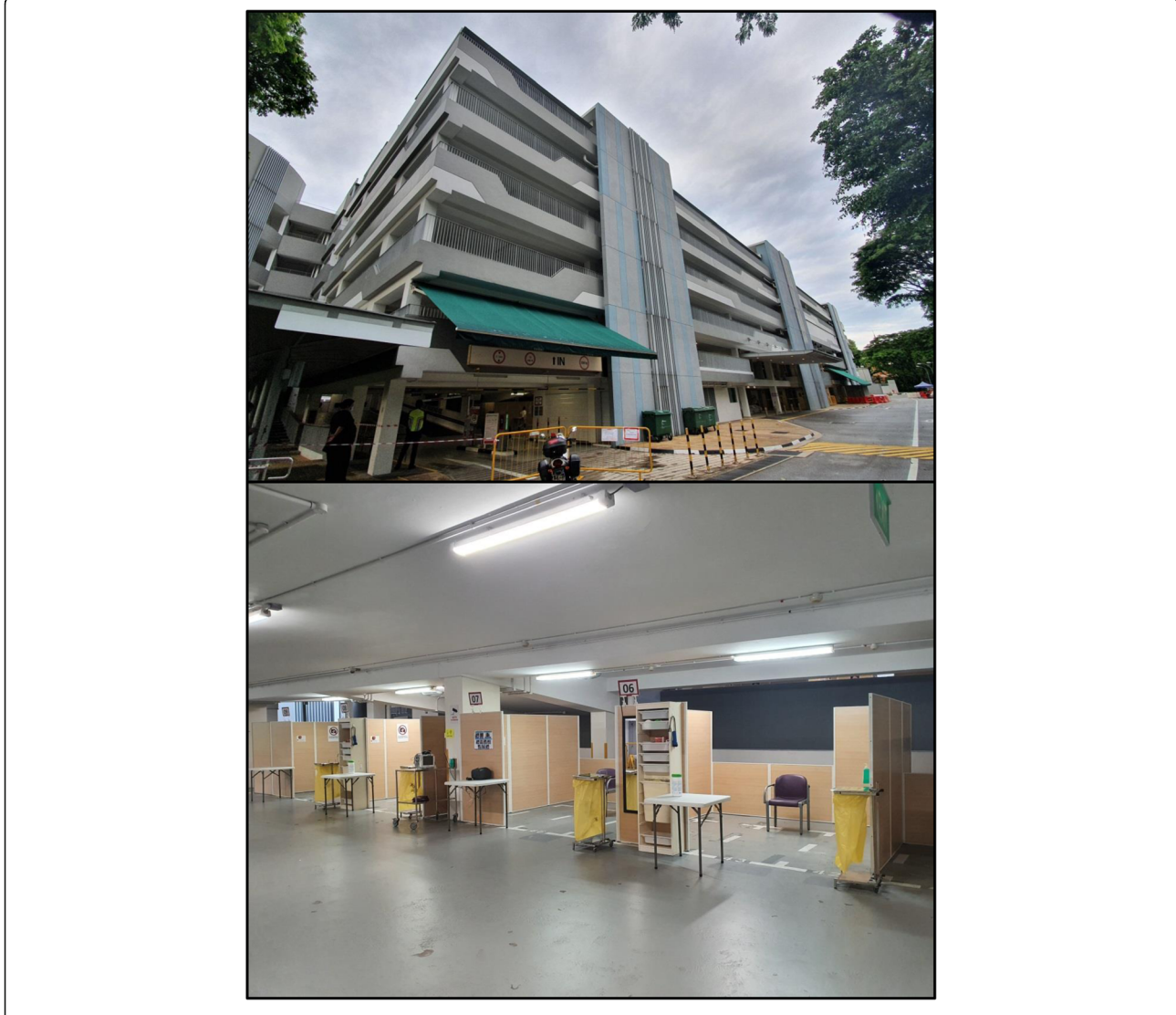
Fig. 5 Exterior facade and interior layout of patient care area in the forward screening area

On a normal day, the ED is manned by three shifts of doctors and nurses over a 24-h period. Owing to the increase in the number of patients coming to the ED, the diversion of ambulances from the main hospital that was