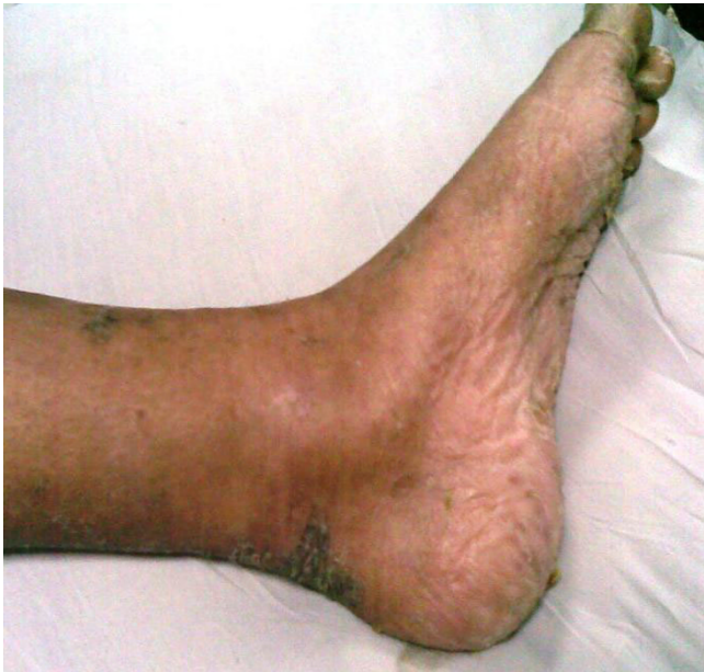
Figure 3 Complete clearing of skin lesions after treatment.

distinct entity. The absence of personal and family history of psoriasis, the association with pregnancy and hypocalcaemia, its recurrence with subsequent pregnancies and the absence of development of chronic plaque psoriasis might suggest that IH is a distinct entity [1,6,7].