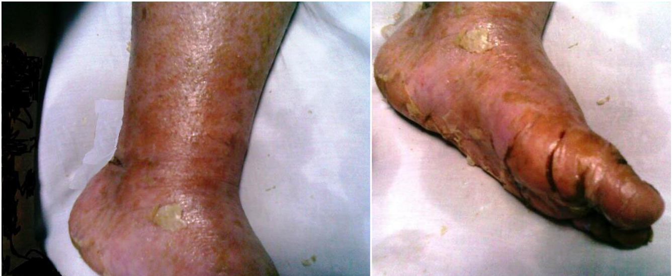
Figure 1 Erythroderma, multiple crusted plaques and pustules in lower limb.

Thyroidectomy was performed for toxic nodular goiter during the second trimester. She developed secondary hypoparathyroidism after surgery. She was not compliant with her medications which included calcium, L-thyroxine and vitamin D.