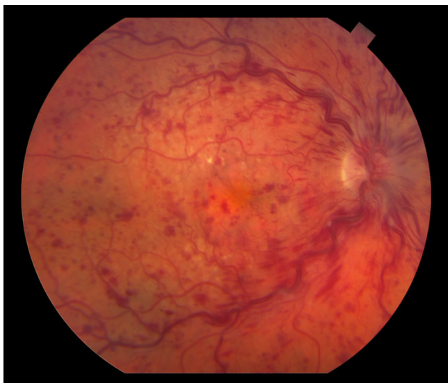
Figure 1 Color fundus photograph of the right eye is showing the presence of venous tortuosity with distension. There are moderate intraretinal hemorrhages throughout the posterior pole with a greater amount of hemorrhages in a peripapillary region. Mild disk edema appears to be present.