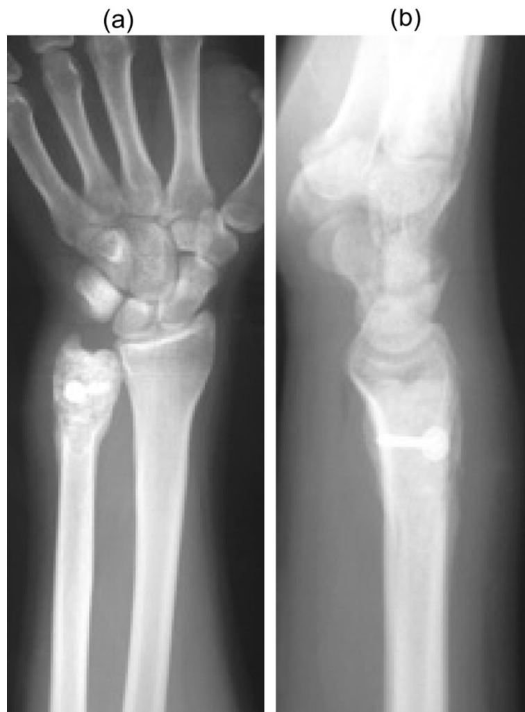
Figure 7 a-b: Post-operative radiology.

Therefore, the correct treatment must achieve a balance between oncological radicality and the restoration of skeletal segment functionality [12-14].