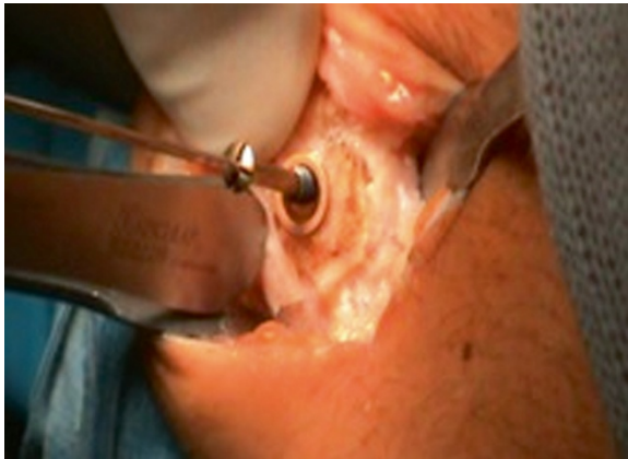
Figure 6 Osteosynthesis and stabilization with a cannulated screw.

The recurrence rate ranges from 5% to 8% when cement is used, and approximately 2.3% after cryosurgery [6,7].