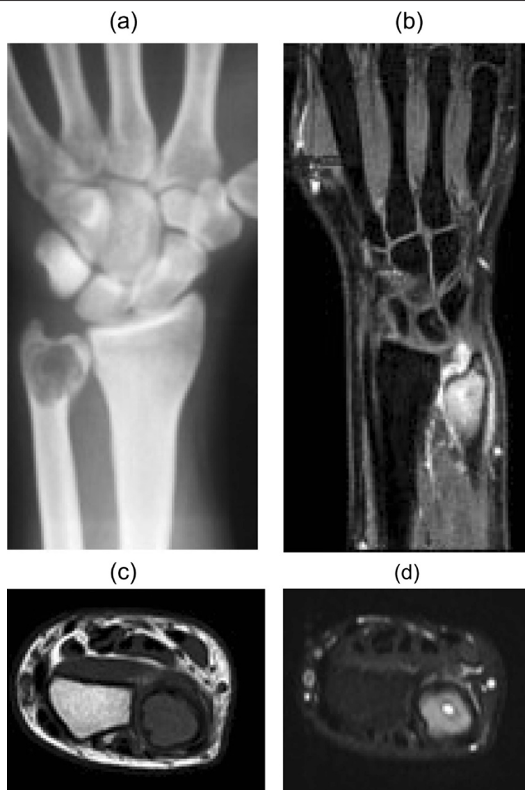
Figure 1 X-rays and magnetic resonance imaging with and without contrast.

The cavity was carefully emptied and curetted (Figure 3), and then 5% phenol was applied in three cycles (Figure 4), with subsequent neutralization by hydrogen peroxide.