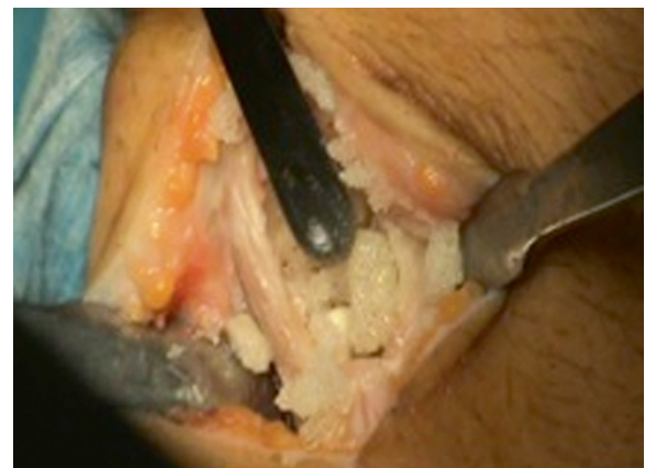
Figure 5 Reconstruction with synthetic bone.