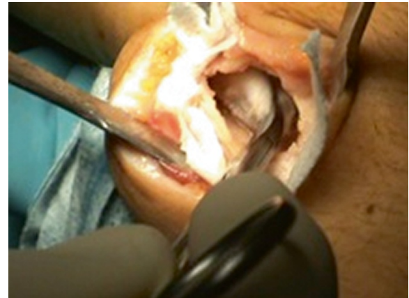
Figure 4 Curettage, adjuvant administration of 5% phenol and subsequent neutralization with hydrogen peroxide.

In 70% of cases, it involves women in the third to fourth decade of life.