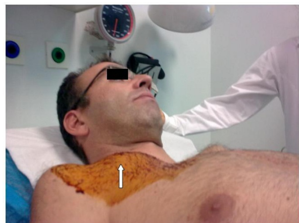
Figure 3 Local, non-pulsatile swelling in the subclavian area (arrow) indicating a subcutaneous collection.

Local complications after axillary artery cannulation can occur either intraoperatively (mostly technical problems, such as arterial injury with bleeding or malperfusion) [1,6-9], or postoperatively (mostly neurologic complications related to brachial plexus injury) [1,4,10]. Compared to the common femoral artery, the axillary artery is located deeper in tissues, in the vicinity of the brachial plexus, and this deep position likely contributes to higher incidence of cannulation-related complications [6,10]. Strauch et al [1] reported 14 complications among 284 patients who had axillary artery cannulation for surgery of the proximal aorta, with brachial plexus injury being the most common complication. Axillary perigraft seroma was not listed as a complication in this or any other relevant published clinical study. From the pathophysiological point of view, perigraft seromas consist of a clear, sterile fluid collection confined within the non-secreting fibrous pseudomembrane surrounding the