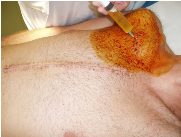
Figure 4 Needle aspiration revealed serous, yellow fluid.