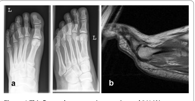
Figure 1 This figure shows anterioposterior and 3/4 (A) conventional radiographs and a T1 weighed MRI section in the sagittal plane (B) of the third toe of the left foot. A. There is a small fracture at the base of the proximal phalanx of the third toe. B. This MRI section shows an intra-osseous lesion, without expansion beyond the cortical border of the phalanx.

trol radiograph showed a normal structure of the third proximal phalanx of the left foot. The patient was discharged from follow-up in the outpatient clinic.