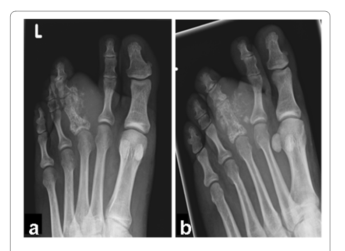
Figure 2 This figure shows anterioposterior (A) and 3/4 (B) conventional radiographs of the left foot. There is a diffuse lesion of the proximal phalanx of the third toe with a moth eaten aspect, cortical destruction and calcifications in the soft tissue.

From November 2008 the patient was treated according to the EURAMOS-1 trial [11]. In February 2009 additional surgery was performed. The third and second rays of the left foot were amputated. The histological specimen showed one small residual lesion in the soft tissue of the second web space. There was a good response to induction chemotherapy as shown histologically by a high rate of necrosis within the tumor. The patient was randomised in the EURAMOS-1 trial and treated with 4 cycles of Adriamycin and Cisplatinum. Methotrexate was