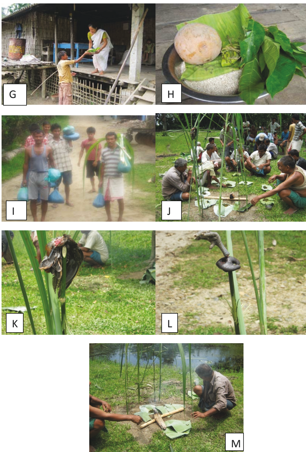
Figure 3 Collection of 'Ajeng Dues' for performing 'Dobur Uie' ritual.

establishing rapport with the Mising people. They will not pass the information to others so easily unless a cordial and social relationship with them is established. After making several trips to these areas good rapport could be established with them. Frequent field surveys were made.