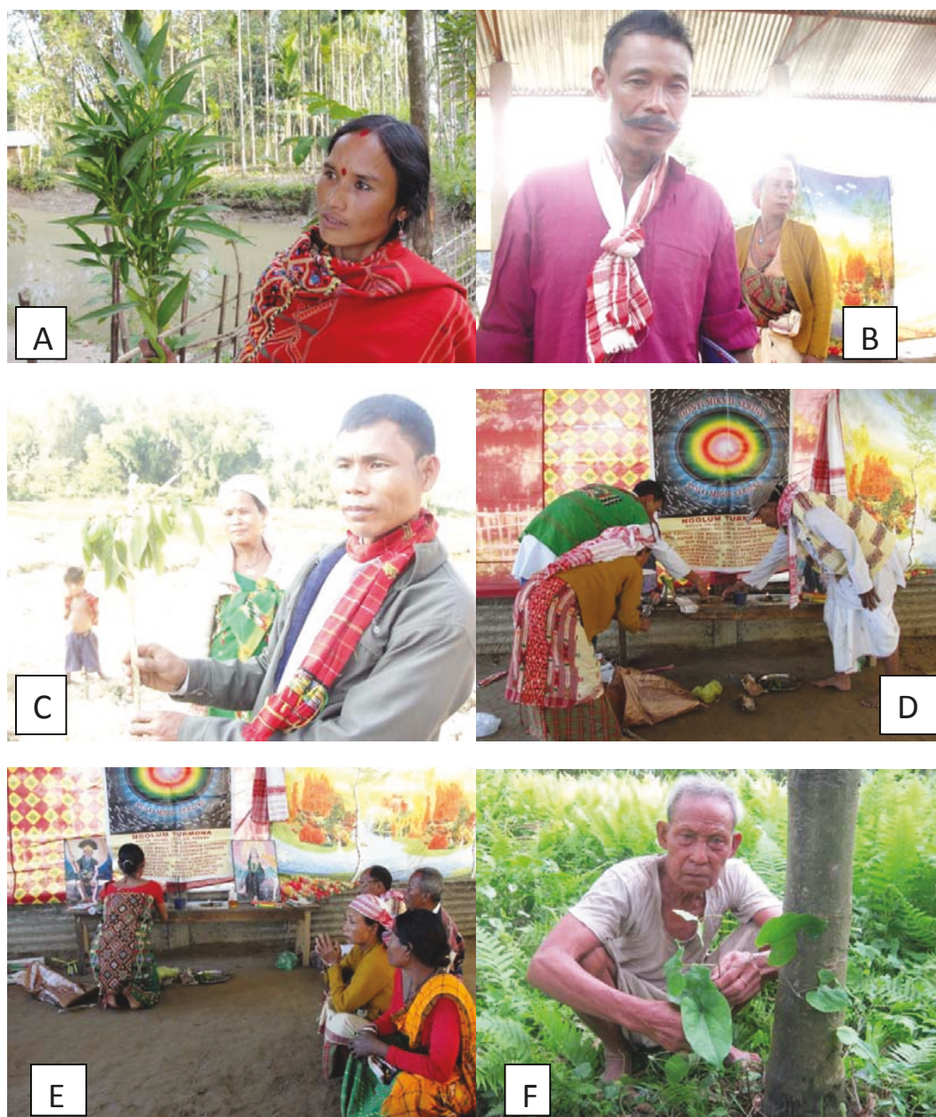
Figure 2 Mising healers giving demonstration about the medicinal herbs and praying Dony-Polo.

other collected eatables are served among the members taking part in the ritual.