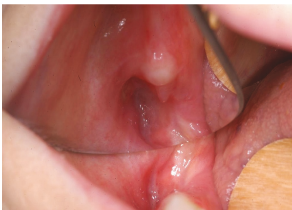
Figure 4 Four months later: the lesion of the mucosa is ulteriorly improved.

Administration [29]. The treatment goals for patients with an established diagnosis of BRONJ are, as recently reported [16-20], to eliminate pain, to control infection of the soft and hard tissue and to minimize the occurrence or the progression of bone necrosis.