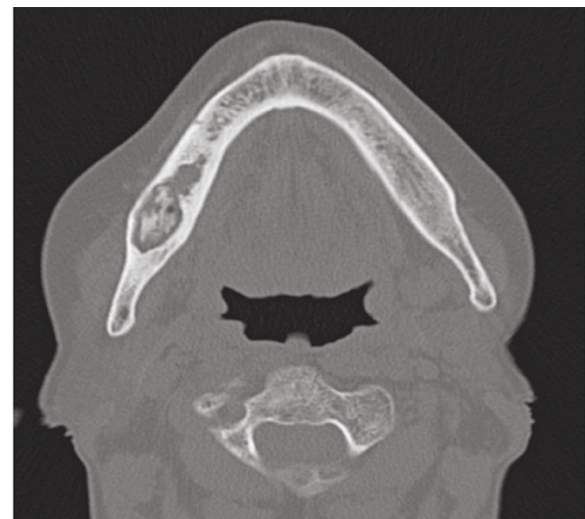
Figure 2 Clinical Onset: computed tomography scan shows bone destruction.

Under local anesthesia an average of 75 ml of bone marrow were harvested from the posterior superior iliac crest by aspiration into heparinized syringes as previously reported by our group [26]. Progenitor cells were isolated and enriched using Ficoll - Hypaque ® centrifugation procedures. This procedure allowed the depletion of mature myeloid and erythroid cell from the