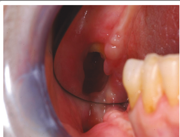
Figure 3 Two weeks later after bone marrow cells transplantation: pink coloured new layer shows progressive improvement of the mucosa.

The procedure was well tolerated, and a week later the dehiscence of the surgical wound was observed, the residual carrier was removed. Then a soft, uniform layer of whitish mucosa dressing the bone cavity was observed. Two weeks later, resolution of symptoms was obtained and the lesion improved (Figure 3) with the pink coloured new layer. Subsequently the patient was seen at our out patients dental-maxillofacial service every two weeks for six months, then every four weeks and showed a progressive improvement. Clinical controls showed progressive improvement of the mucosal layer