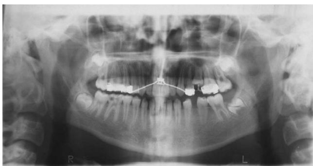
Figure 6 After distalization panoramic radiograph of the patient.

End of treatment, a positive overjet and overbite was established. Good torque control was maintained while the mandibular incisors were retracted resulting in better incisal inclination after treatment. Correction of the malocclusion was accomplished with dental movements (Figures 8, 9, 10, 11, 12). Caries in the lower right first molar was restored with the amalgam filling.