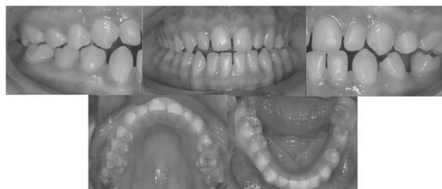
Figure 2 Pretreatment intraoral photographs of the patient.

In pretreatment cephalometric evaluation (Figure 4, Table 1); the maxilla was normal to the cranial base (SNA 86°), and in centric occlusion the mandible was normal position to the cranial base (SNB 84°). The ANB (2°) indicated a Class I skeletal relationship. The maxillary incisors were slightly upright, while the mandibular incisors were