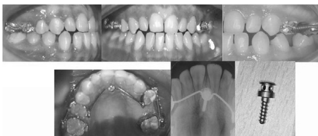
Figure 5 After distalization intraoral photographs and occlusal radiograph of the patient and intraosseous screw.

When upper left first molar was moved into an overcorrected Class I relationship by approximately 2 mm, the distalization was ended (Figures 5, 6, 7).