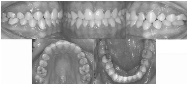
Figure 9 Posttreatment intraoral photographs of the patient.