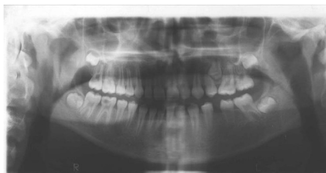
Figure 3 Pretreatment panoramic radiograph of the patient.