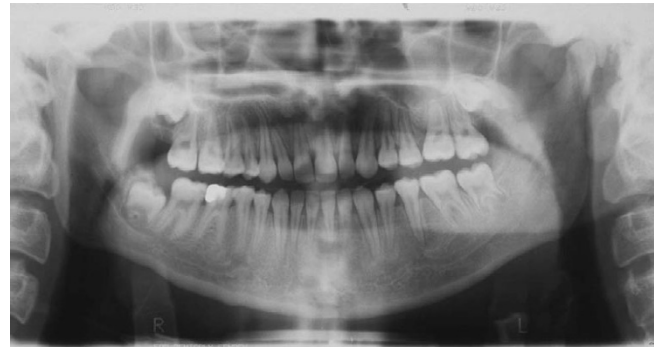
Figure 10 Posttreatment panoramic radiograph of the patient.

Anchorage control is of great importance in orthodontic treatment. In the treatment of Angle Class II malocclusions, with Class I skeletal relationship, upper anterior crowding or excessive overjet can be treated with either unilateral/bilateral upper premolar extraction or distalization of upper posterior teeth consolidation of the anterior teeth [1]. The extractions create generally bad emotional effects on the patients that fear of dentist is present nearly in all people. Closing of the extraction spaces need extra