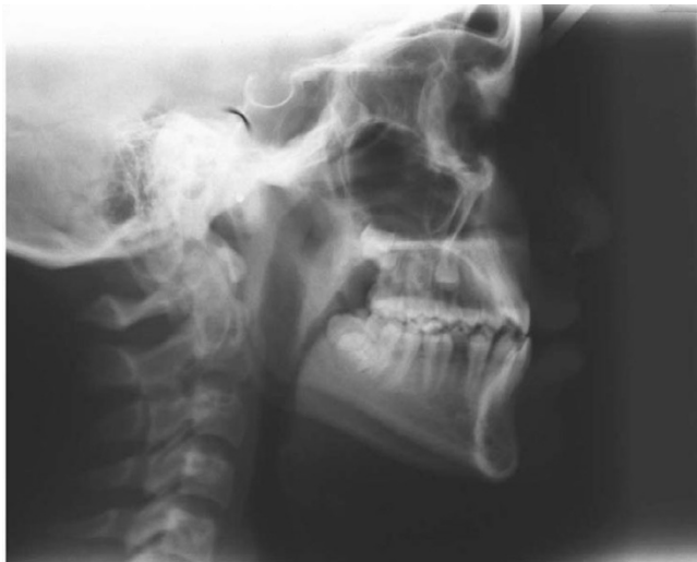
Figure 4 Pretreatment cephalometric radiograph of the patient.