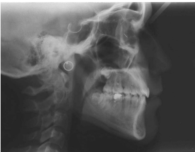
Figure 11 Posttreatment cephalometric radiograph of the patient.

We used the intramaxillary fixation screw alternatively to the osseointegrated implants that would provide enough stability to actively distalize maxillary molars uni-or bilat-