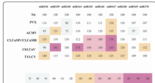
Figure 3 A heat diagram summarizing the levels of miRNAs detected in N. benthamiana upon virus infection. The signal of each band was quantified using imaj J and normalized with ethidium bromide stained RNA. The levels of miRNAs in N. benthamiana were taken as 100 and rest of the miRNA levels were calculated relative to that and color scheme is given which is also shown.

Recent studies of both animal and plant viruses have shown that viruses alter the RNA silencing pathway to regulate host gene expression [35,36]. One of the limitations at present is that the mechanisms controlling such activities are unclear. However, a generally accepted concept is that RNA silencing is a natural defense response of plants against invading viruses. To counter RNA silencing viruses encode certain proteins that can block the RNAi pathway and are referred to as suppressor of gene silencing [36,37]. It has been demonstrated that viral suppressors of RNA silencing can interact/interfere with the miRNA pathway [30,31], although it remains unclear whether these interactions are the part of the survival strategy of viruses or just side effects (collateral damage) of their infection cycle. In the work presented here the interaction begomoviruses ACMV, CLCuMV and its associated CLCuMB, TYLCV and CbLCuV with selected host miRNAs was studied. With