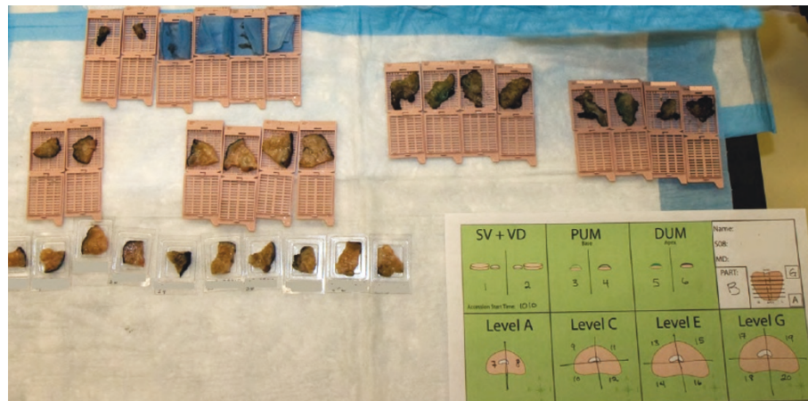
Figure 2 A photograph showing the labelled cassettes of prostate tissue from a single prostate specimen prior to snap freezing.

blood loss, total WIT (including intraoperative time, collection time and processing time), total operating time, and storage time (number of months between flash freezing and RNA extraction). Subgroup analysis was performed using the student t-test for the statistically significant variables included in the best model. All statistical analysis was performed using SPSS (v18.0 for Windows; IBM, Armonk, NY).