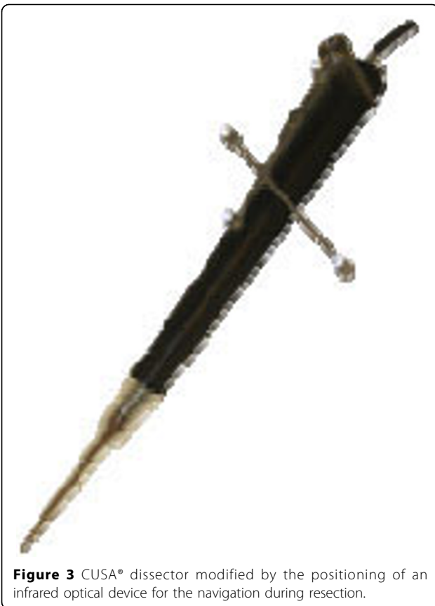
Figure 3 CUSA® dissector modified by the positioning of an infrared optical device for the navigation during resection.