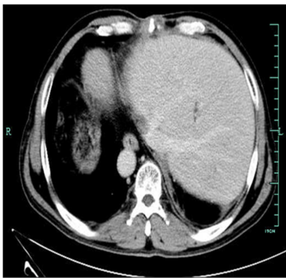
Figure 3 Graft image surveillance at 3 months post transplant. Abdominal computed tomography scan shows a normal liver graft in the up left quadrant.

The present case was an ABO-incompatible LTx that was often performed in emergencies when ABO-compatible graft was unavailable. It was used to be a controversial issue because of the high risk of antibody-mediated rejection due to preformed anti-ABO antibodies. Various methods have been applied to improve the outcome of ABO incompatible LTx, including graft local infusion, use of rituximab, intravenous immune globulin, plasma exchange, and splenectomy [17,18]. Especially with the application of rituximab since 2003, a novel anti-CD20 antibody terminating B-lymphocytes, graft survival has been similar to that of ABO-matched transplants. ABO incompatible LTx now has become a feasible option and is no longer an obstacle for liver transplantation [19,20]. From the surgical point of view, situs match makes the transplant procedure much easier and have less potential surgical complications. Although the present case was not in emergency, advantages of the anatomic homomorphism prompted us to perform LTx with ABO-incompatibility between donor and recipient. The patient was treated with an ABO-incompatible protocol of our own using rituximab, intravenous immune globulin. The excellent post transplant outcome and no complications related to blood type mismatch after 6 months follow-up suggested a successful LTx.