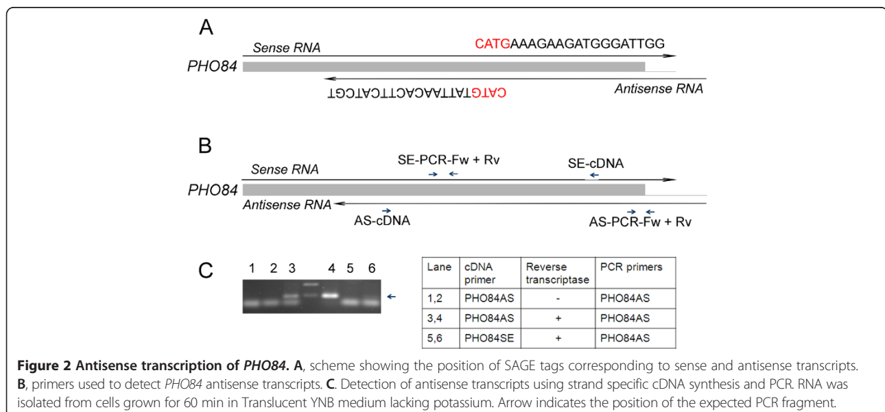
Figure 2 Antisense transcription of PHO84 . A , scheme showing the position of SAGE tags corresponding to sense and antisense transcripts. B , primers used to detect PHO84 antisense transcripts. C , Detection of antisense transcripts using strand specific cDNA synthesis and PCR. RNA was isolated from cells grown for 60 min in Translucent YNB medium lacking potassium. Arrow indicates the position of the expected PCR fragment.

In this study as well as in the study using DNA microarrays [21] a strong induction of genes involved in phosphate metabolism, including PHO84 , was found. Thus, despite the presence of phosphate in the medium, these genes are not repressed, when potassium is absent. The transcription factor Pho4 plays a key role in the regulation of these genes. The subcellular localization of this transcription factor is regulated via phosphorylation by