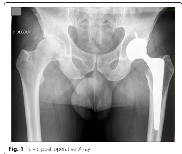
Fig. 1 Pelvic post operative X-ray

On clinical examination, hip range of motion was pain-free and unchanged. Radiographic examination did not show any modification, as compared to previous ones (Fig. 1). A pelvis CT-scan was performed to measure cup and femoral stem orientation, and to detect a potential fracture of the ceramic. The cup inclination angle was 49.6°, cup anteversion was 23° (Fig. 2); the