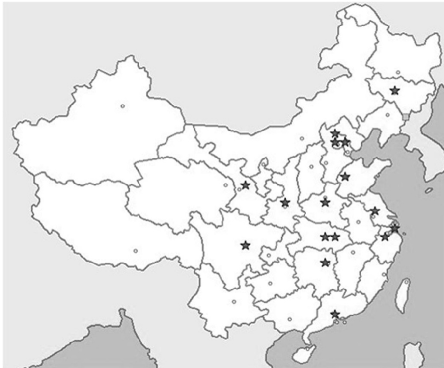
Figure 1 Locations (indicated with '★') of the 16 institutions offering health-related disciplines via Internet-based degree education in China.

Higher education institutions in China have also developed some free Internet-based learning resources for undergraduate students in recent years. One of these was the National Exquisite Course Project. This project was launched by the Ministry of Education in April 2003 to promote the development of high-quality online courses in Chinese higher education institutions. The courses developed in this project were put on the website of "National Exquisite Courses" (see Additional file 1: Table S1). Another source of free online courses was the