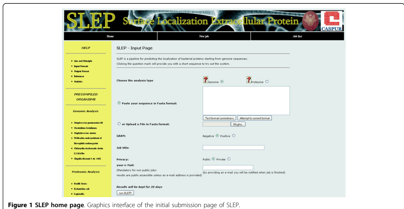
Figure 1 SLEP home page. Graphics interface of the initial submission page of SLEP.

In Table 3 we compare our results with the use of PSORTb alone. For completeness, we report in the same Table the accuracy of other available methods for the relevant datasets [33-38]. Notice that the tools included in SLEP have been selected for their accuracy, but also