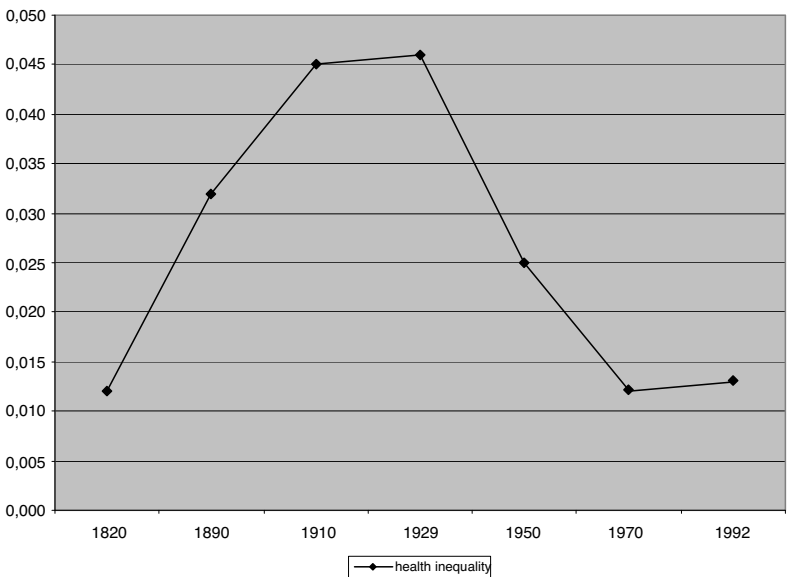
Figure 5.1 Health inequality across countries