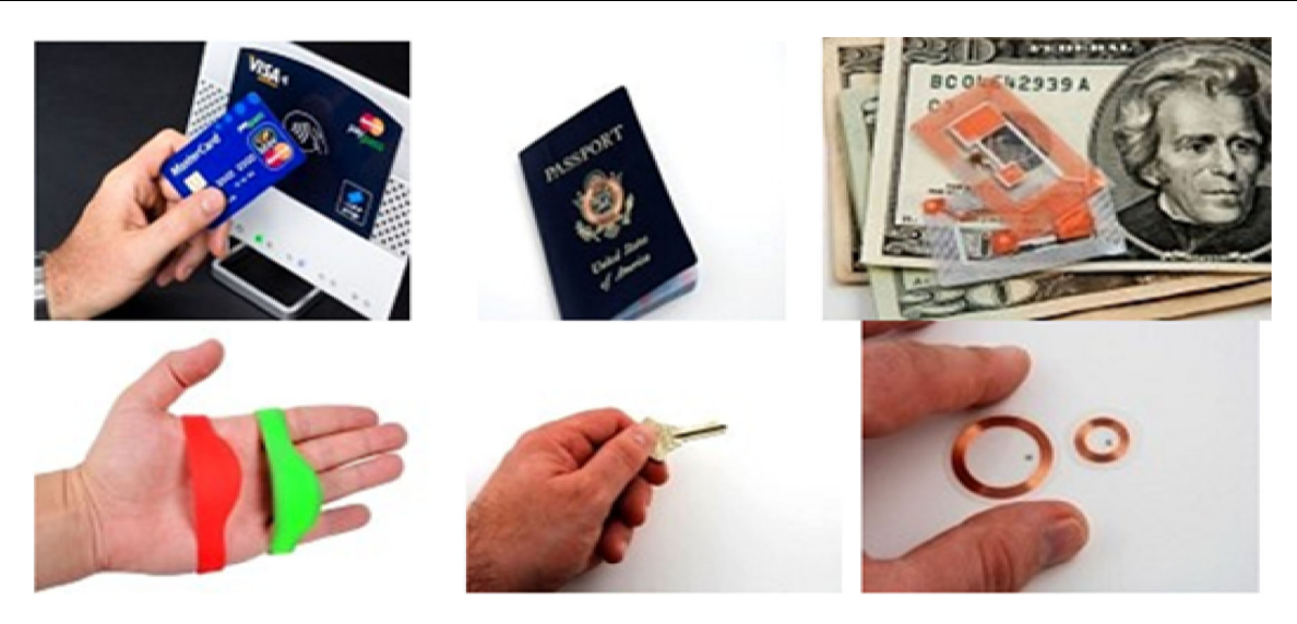
Fig. 1 RFID tags and bands

shopping malls, and many other usage in sports, fashion, robbery proof chips.