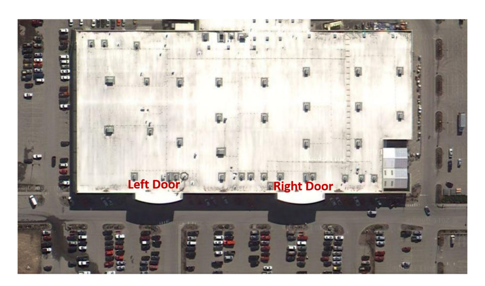
Fig. 2 Supermarket layout