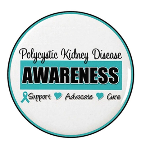
Fig. 1 Pin-back button for PKD Foundation

In blocks assigned to control, there was no solicitation.<sup>2</sup> In blocks assigned to treatment, we placed a male solicitor at the right door who actively solicited sales of the PKD Foundation pins.<sup>3</sup> He stood by a small table that had an informative poster about the PKD Foundation and a collection box for proceeds. In all blocks, two experimenters sat in vehicles and counted the number of customers entering the store. Each experimenter was assigned to monitor traffic through a single door.<sup>4</sup> Finally, we only counted incoming shoppers, and ignored outgoing shoppers.