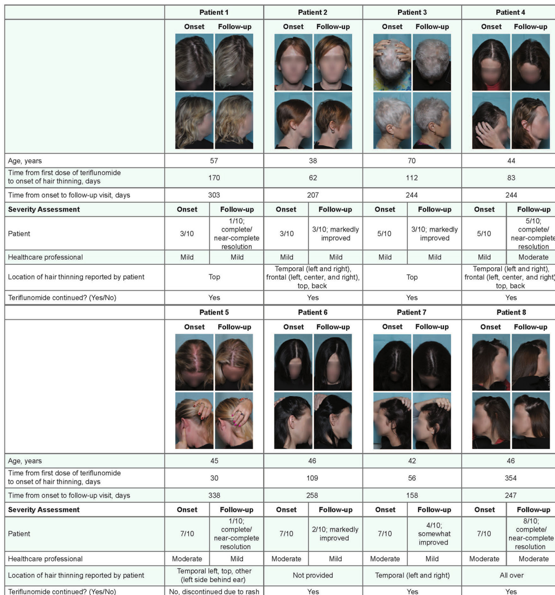
Fig. 1 Examples of hair thinning at onset and follow-up. HCP healthcare professional

Over the course of follow-up, two patients discontinued teriflunomide treatment, one temporarily because of hair thinning. Three other patients discontinued treatment for other reasons: one discontinued temporarily owing to gastrointestinal upset, and the two remaining patients discontinued permanently because of rash and gastrointestinal upset.