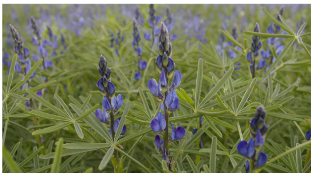
Fig. 1 Narrow-leaved lupin ( Lupinus angustifolius L.) grown in a long-term field experiment in northeastern Germany.

all found lower yield stability in a range of grain legumes than in cereals.