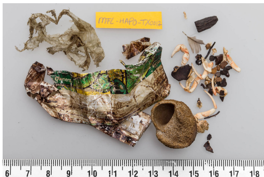
Fig. 1 Foreign bodies found in the stomach of harbour porpoise nr. MFL-HAPO-TX0012 with on the left various plastic sheets, and on the right an old shell, hermit crab bits, and a mix of small stones, feather and bits of wood. The ruler scale bar shows size in centimetres

possibly due to the reduced sample size. Figure 1 illustrates the presence of non-food materials in a porpoise stomach also containing plastic. In the ESM similar photographs have been added for some of the more extreme cases, to further illustrate the character of such non-food items which almost all are believed to originate from the bottom. GLMM analyses on all samples (see ESM for details) suggest a significant model contribution from correlation between the presence of plastic litter and the mass of ingested bottom fish species. Such correlation was not observed for the mass of pelagic fish species. In GLMM analyses of the full dataset, the numerical abundance of bottom related non-food items, although fairly highly